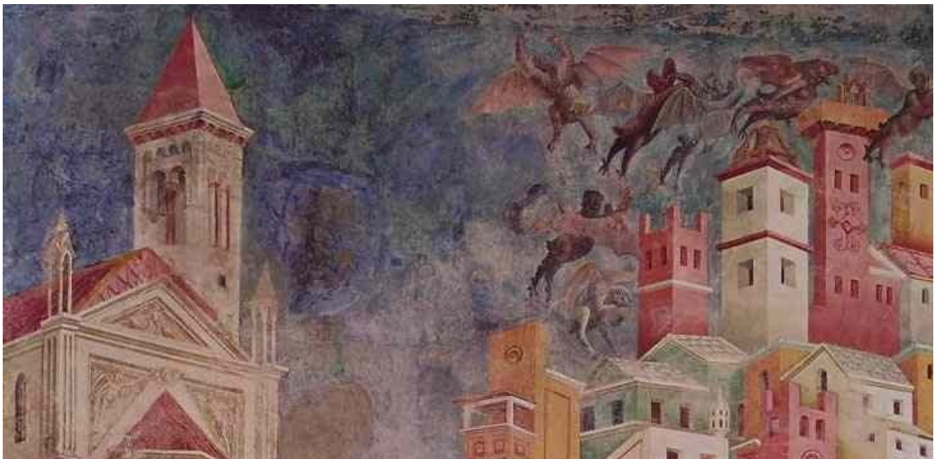
Legend of St. Francis fresco cycle --Upper Church, San Francesco, Assisi (particular)